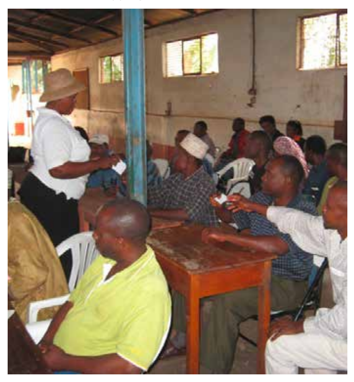
>> To read more about the MDG Acceleration Framework, see http://www.undp.org/content/undp/en/home/mdgoverview/mdg goals/acceleration framework/

The ILO technical support is built on experience from past and on-going work related to cooperatives and young women and men through ILO's programmes such as the Cooperative Facility for Africa (COOPAFRICA), the Youth Entrepreneurship Facility (YEF) or through initiatives under the UN framework e.g. United Nations Development Assistance Framework (UNDAF) and the United Nations Development Assistance Plan (UNDAP). The programme will be implemented by the ILO's Country Office for East Africa based in Dar es Salaam, Tanzania, while the Cooperatives Unit will provide technical backstopping.